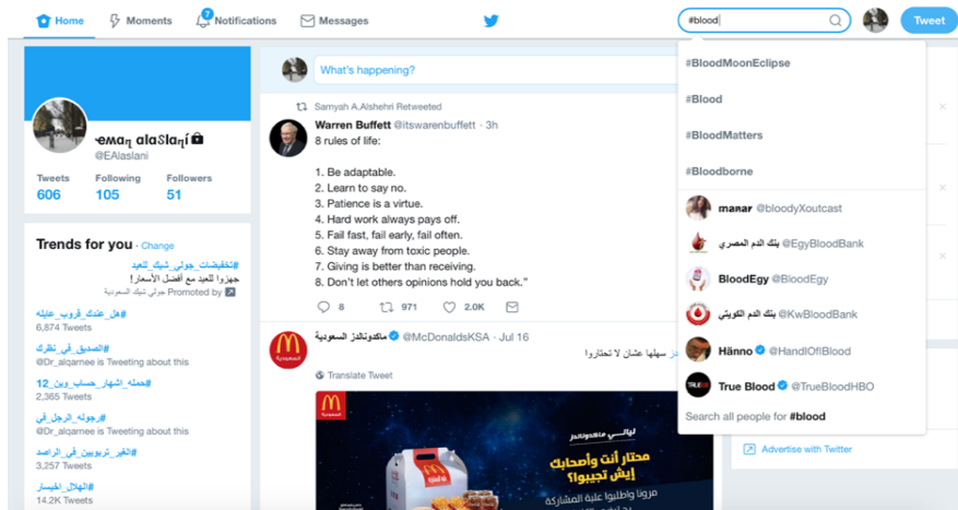
Figure 2. The home page for Twitter application.

Twitter is “powered by people all around the world [and] lets them share and discover what’s happening now” (Twitter.com). This supports McQuail’s (2010) observation that “mass media and society are continually interacting and influencing each other.” Twitter plays an important role to let users discuss international and local news, and it helps them to interact on any topic, analyzing and sharing what is happening around them. Twitter is of “cultural interest (and) fashionable status because of the multiplicity of its functions as a news-gathering and marketing tool” (Ahmad, 2010). However, the various ways of using Twitter makes understanding the uses and gratifications of this specific social media site complicated. Twitter offers a more effective way for "information sharing and for supporting activism and mobilization" than Facebook and other social media platforms (Comunello & Anzera, 2012). Also, due to open Twitter profiles, “Users can both read tweets by users they follow and have access to general discussions through keyword searches known as #hashtags” (see Figure 2) (Comunello & Anzera, 2012) even if they do not follow these users.