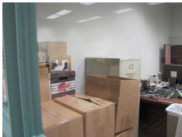
Everything in everyone's offices was packed up in boxes. (Dec. 2011)