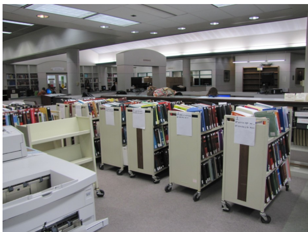
Reserve books were temporarily removed from the shelves. (Dec. 2011)

The library officially re-opened on Tuesday, January 17th . Visitors can now enjoy an updated look when they enter the library. The massive project was several months in the making. From December 9, 2011 through mid-January 2012, the library was under around-the-clock construction. Along with the carpet replacement, the library was fitted with a new fire alarm system. Here is a brief scrapbook of some of the ways everyone at the library prepared for the project.